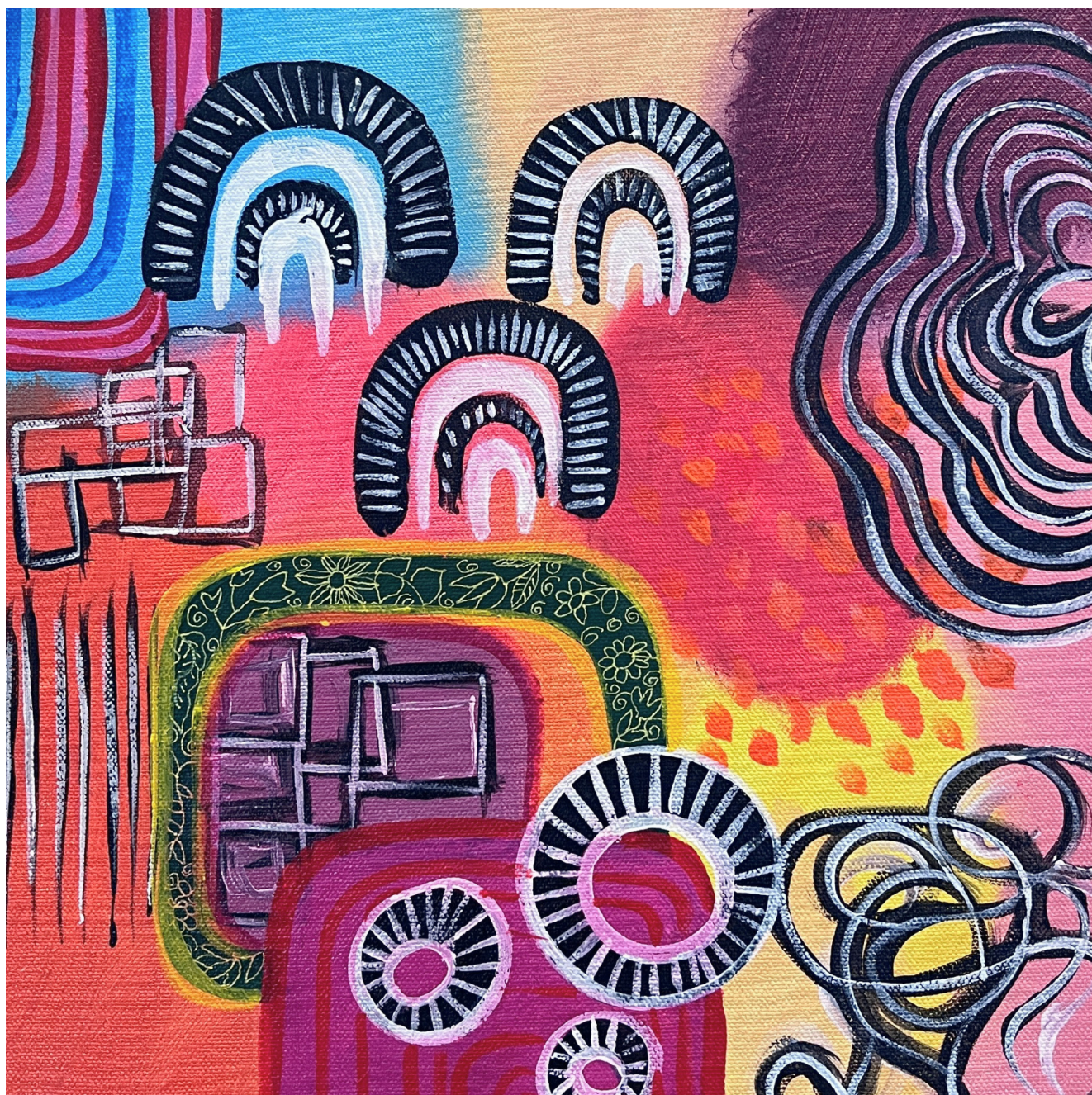
70's Illusion 1 (2023) by Jarrod Wendt